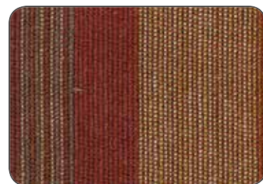
1006932 Burnt Sienna