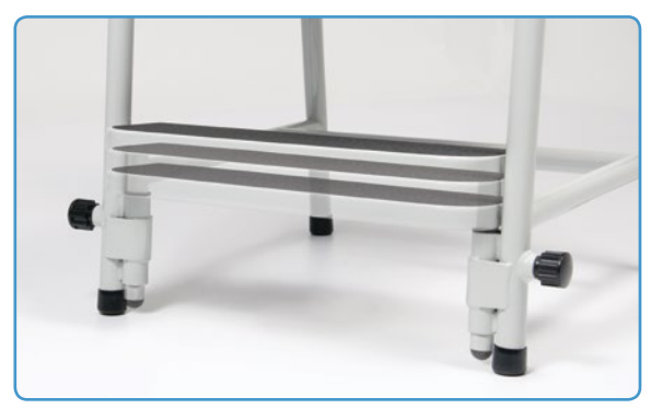
Footrest can be adjusted to three different heights.