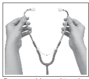
Decrease binaural tension (loosen)