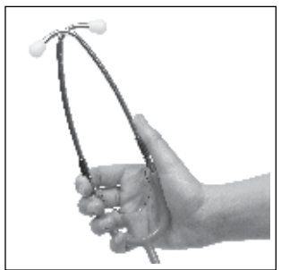
Increase binaural tension (tighten)