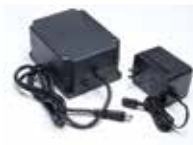
Battery Backup 999-0831-003 Charger 999-0711-002

Underbed Light clearly illuminates where the resident gets in and out of the bed ZA90010 USB Power Supply eliminates using a separate wall outlet for cell phone and tablet charging ZA90020