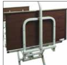
Trapeze Adapter (mount) ZA90100