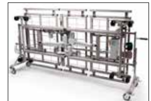
Zenith/Matrix Bed Cart ZA89900

Embedded staff control with safety-inspired two-stage lockouts enables caregivers to lock-out individual features to the resident