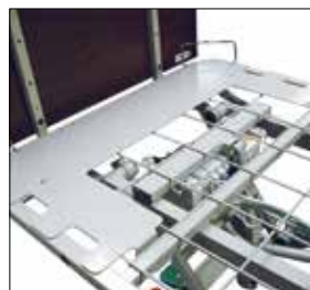
Length Extension Kit ZA90840 4" extension