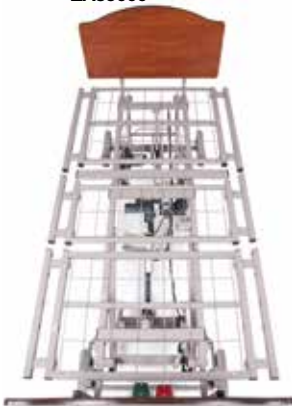
Pin-on Wide Kit ZA858000 39" extension ZA851000 42" extension