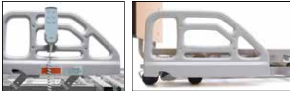
Counter-rotating Assist Device ZA84200 US Patent-awarded counter-rotating assist device