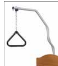
Trapeze (bar, chain, triangle) ZA78100