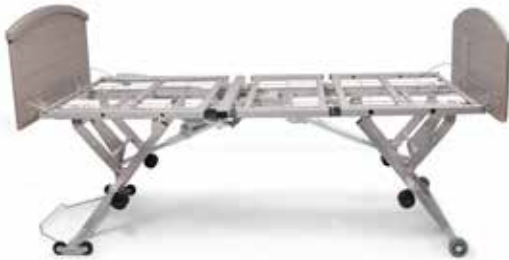
High Position Height Travel Range: 27"