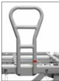
Fixed Assist Device ZA85000