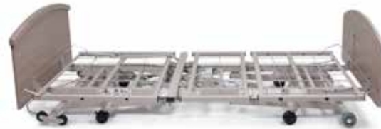
Low Position Height Travel Range: 8.95"