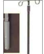
Board Mounted IV Socket ZA19000