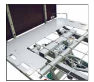
Length Extension Kit ZA90500 4" extension ZA90400 8" extension