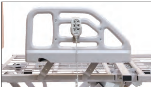
Warm-to-the-touch Half Length Assist Device ZA84200

Optional Half Length Assist Device and Assist Bars provide a sturdy and secure hand hold to assist residents in and out of bed. Assist devices are removable without tools and meet FDA Entrapment Guidelines.