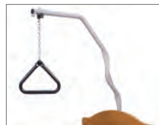
ZA79000 (for use with ZA78100 Trapeze Bar)

Trapeze Adapter Optional trapeze adapter allows for easy attachment of trapeze system to headboard within easy reach for residents for repositioning themselves.