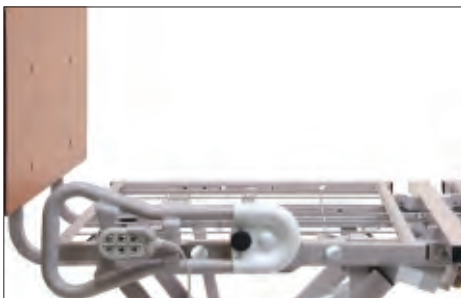
Pivot Assist Bar ZA85400 (tool-less) ZA87900 (bolt-on)