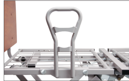
Fixed Assist Bar ZA85000 (tool-less) ZA87800 (bolt-on)