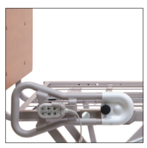
Pivot Assist Bar ZA90300 (tool-less) ZA87900 (bolt-on)